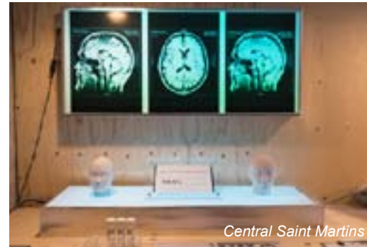
Central Saint Martins