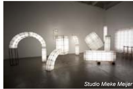
Studio Mieke Meijer