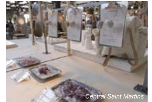
Central Saint Martins